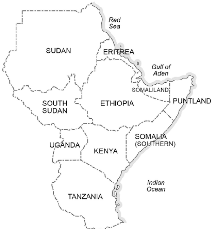
Figure 1: Eastern Horn of Africa

Violent conflict and drought and the related humanitarian crises and famines are defining characteristics of the region. Each set of conflict